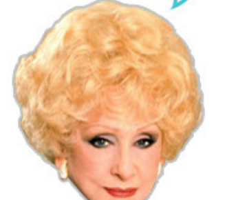
Mary Kay Ash Founder of Mary Kay Cosmetics

“There are two things that people want more than sex and money..... recognition and praise”