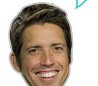
Nick Woodman Founder and CEO of GoPro

“If I'm a content creator and get recognition for my work, that's going to motivate me to spend even more time on my next production and make it even better”