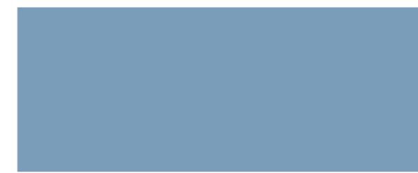
Quantum Blue Gray

Pantone 152c RGB 230 114 0 CMYK 0 61 100 0 Hex #E67200