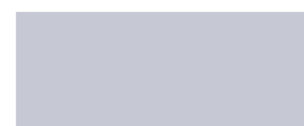
Very Light Gray

Pantone 423c RGB 137 14 150 CMYK 44 33 29 9 Hex #898D96